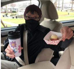
Cookie and Hot Chocolate Day!

He gave his word, refused to break a vow, and lost his one chance at true love. Now they've come for his land. Hap Wilkes is a man facing a painful past, an increasingly uncertain future, and now fights with everything left in a broken and failing body, to keep the one thing still left to him - his pride. The Irish Cowboy is a story of loss, secrets, redemption, and the always present human yearning for love and forgiveness.