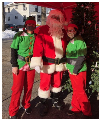
Merry Christmas and Happy New Year!