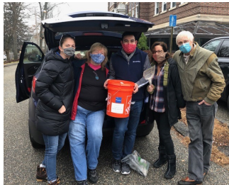
Sand For Senior! Thank you Peoples Bank!